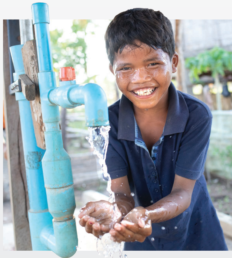
A CAMBODIAN BOY ENJOYING CLEAN WATER PROVIDED BY A CERAMIC WATER FILTER.

SPI is working in a hard-to-reach village in Yemen by constructing a permanent clinic with sustainable infrastructure to meet basic health needs in the community. This clinic has been funded in partnership with the States of Guernsey Overseas Aid Commission and should be complete by July 2023. Once operational, the clinic will provide a package of integrated preventative and basic curative services as well as community health outreach, improving healthcare access for almost 3,000 people.