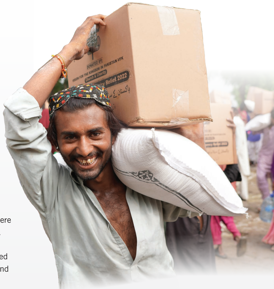
FOOD BEING DISTRIBUTED IN PAKISTAN

Within Afghanistan, vulnerable individuals received food packages, alongside support for education and provision of vocational training.