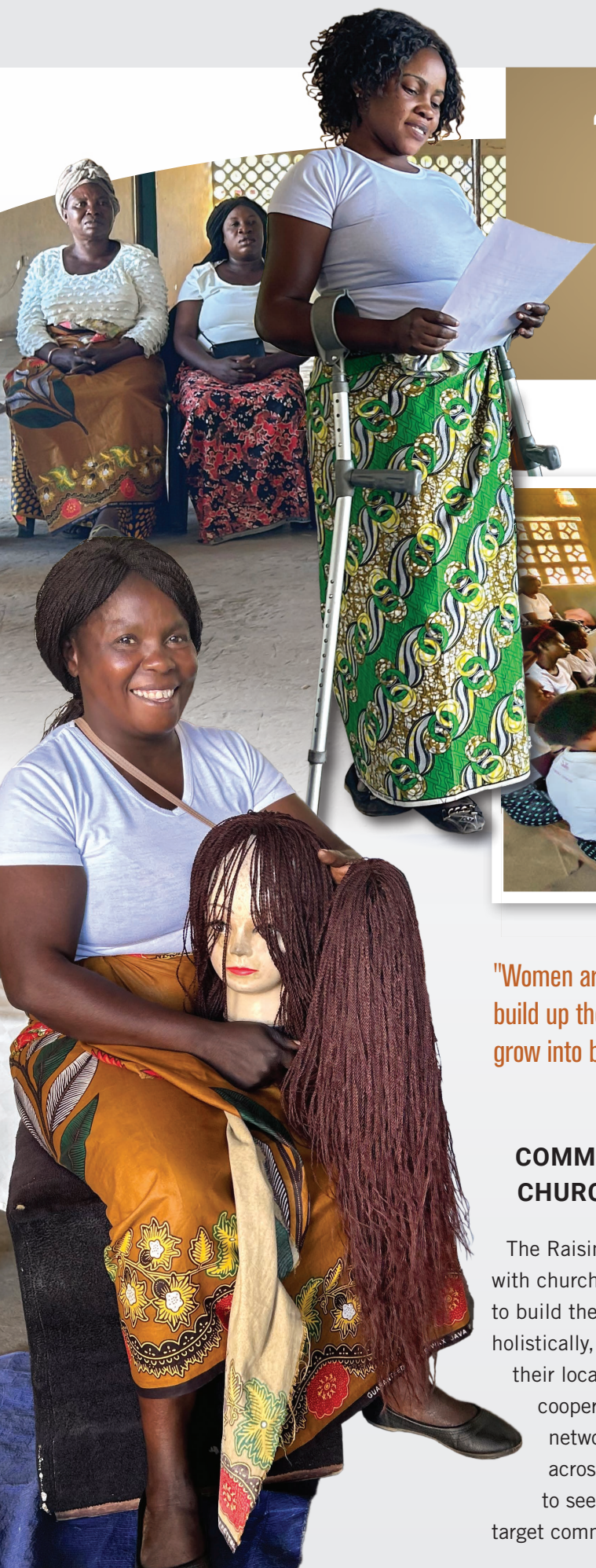
LEFT AND BELOW: A WOMEN'S SAVINGS GROUP MEETING IN PROGRESS