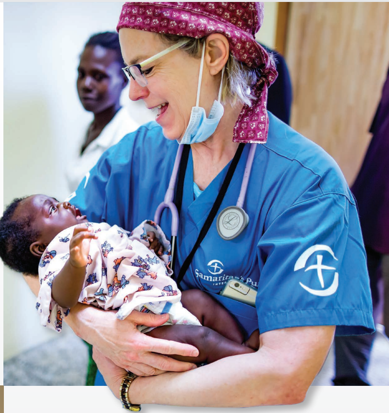
ABOVE: A SOUTH SUDANESE BABY AFTER HIS CLEFT LIP SURGERY

SPI supported three medical mission programmes during the 2022/23 year. Funding was provided to support cleft lip and cleft palate missions providing surgery for up to 200 individuals in South Sudan, as well as support for eye cataract surgeries in Liberia for patients who would otherwise not have access to this treatment. In Mongolia, SPI also provided support for children to receive life-saving surgeries for congenital heart defects.