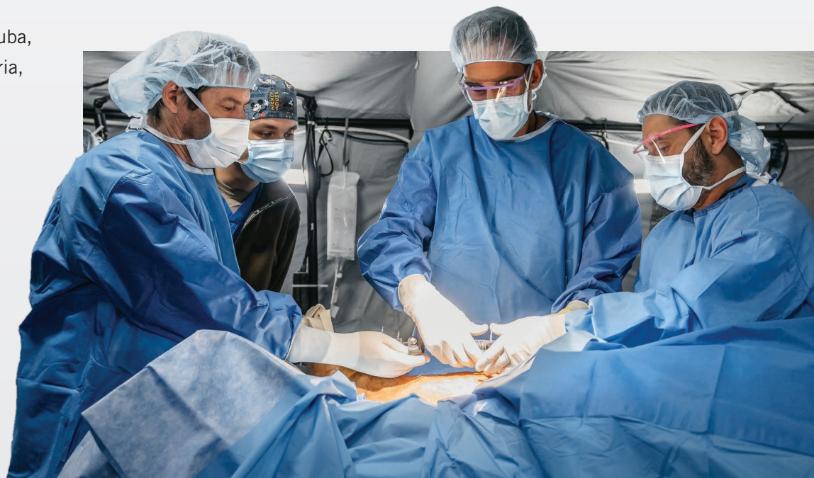
EMERGENCY FIELD HOSPITAL SURGEONS OPERATING ON A CASUALTY OF THE FIGHTING IN UKRAINE

All assistance, whether developmental or emergency relief, is provided without prejudice and irrespective of background, religion, political affiliation, gender, sexual orientation, age or ethnicity. From access to clean water for the first time to life-saving infant care, and from feeding refugees to skills for brighter futures, Samaritan's Purse is demonstrating God's love to the lost, the hurting and the broken, giving them a tangible hope for the future and a foundation upon which they can build for tomorrow.